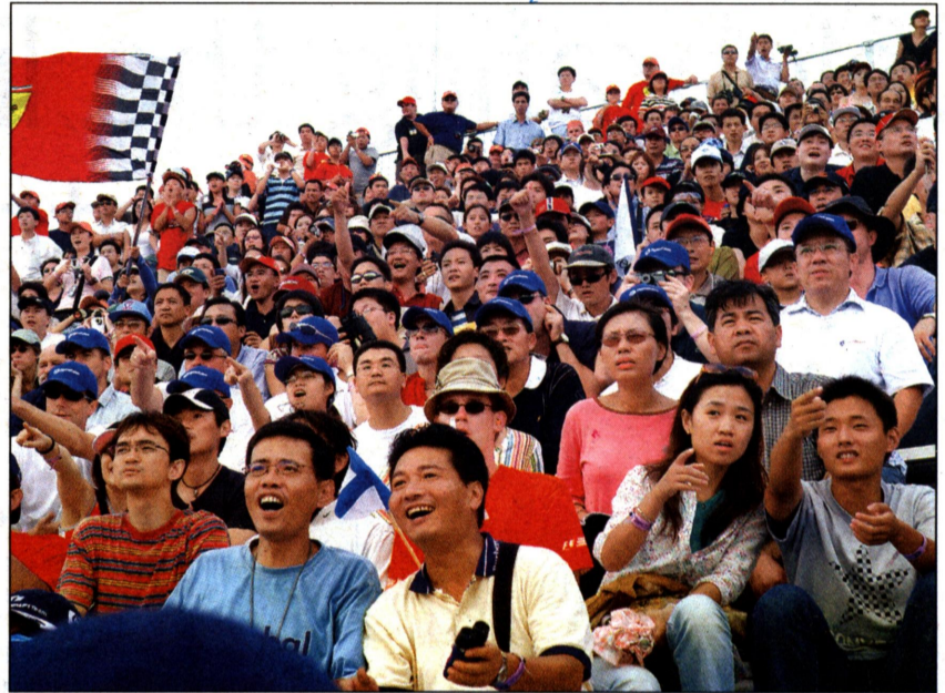
Spectators cheer at last year's F1 China Prix at the Shanghai International Circuit. The race was won by Ferrari's Kimi Räikkönen with Fernando Alonso finishing second and Felipe Massa finishing third. Championship leader Lewis Hamilton retired from the race after going off at a very wet pit entrance after worn tyres stuck in the gravel.

Route: Take Hujia Highway A12 to Jiading District Exit. Drive past Bole Rd. and go straight to Shaxia Road. Then turn right into South Street. You can also take bus Hutang Line or Tourist Line 6A to Tacheng Road.