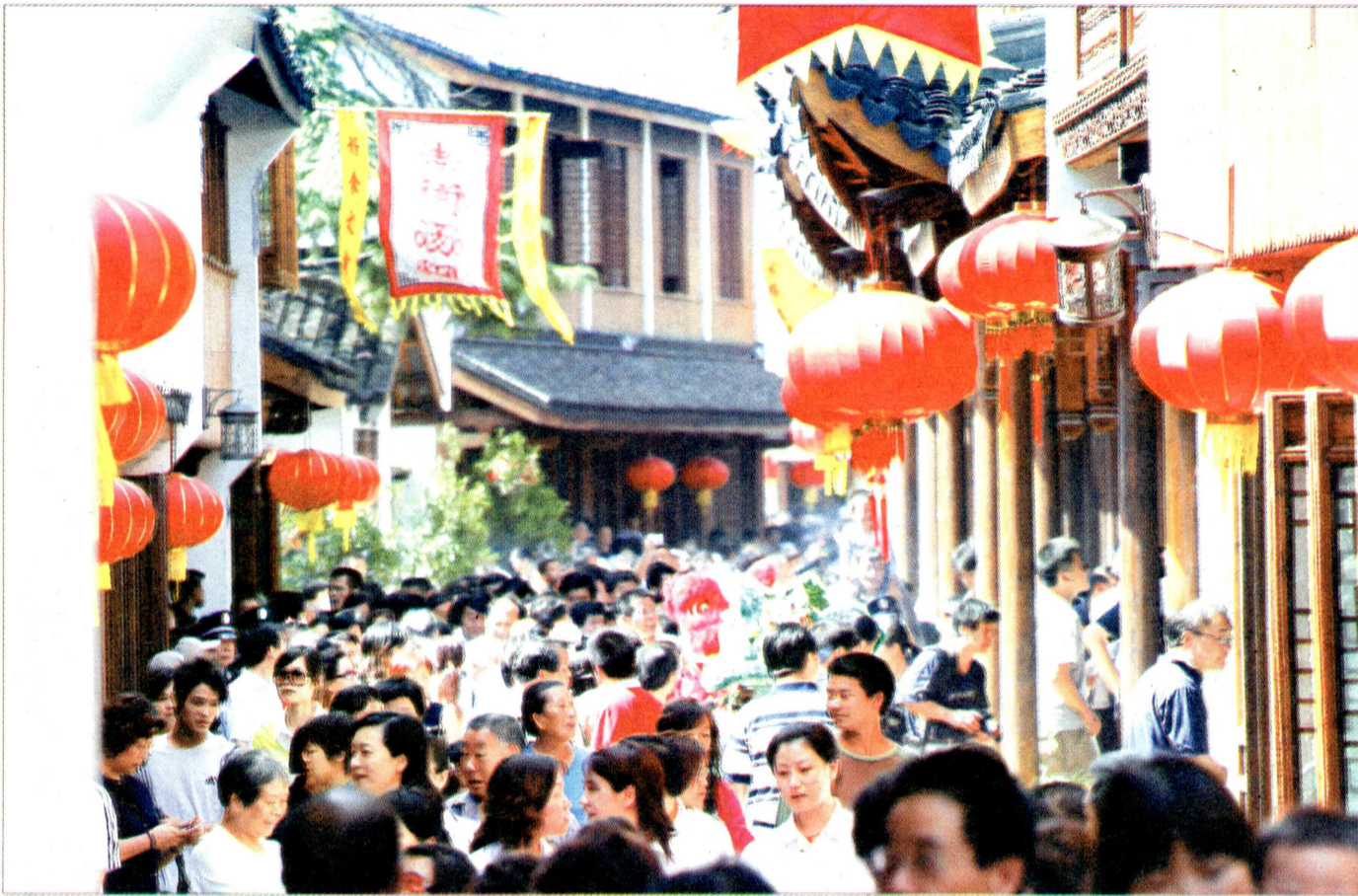
Jiading Temple Fair has attracted a large crowd. Going to the temple fair gains popularity among locals.