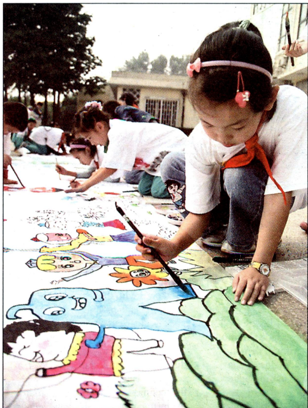
Events at the Demonstration Sites during World Expo 2010 Shanghai China