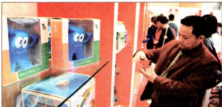
Customers check Expo souvenirs in Jiading Shopping Mall.

For Expo licensed products in Jiading there are only two manufacturers, four enterprises doubling in producing and selling and 22 retail outlets. It is estimated that there will be about 300 million yuan worth of products sold during the event. Questions about Expo licensed products should be directed through 6271-6005 from 9am to 5:30pm.