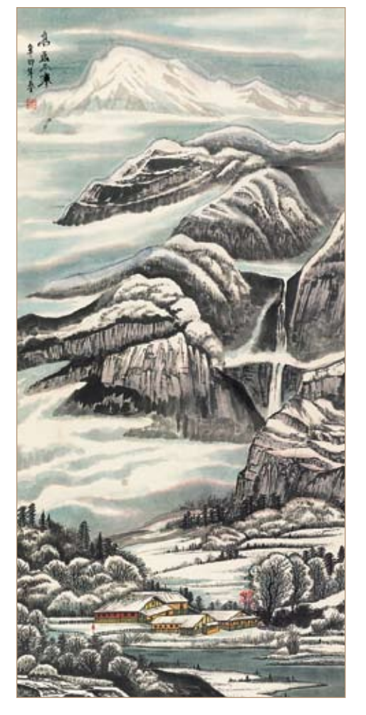
"Chilly Winter on the Plateau"