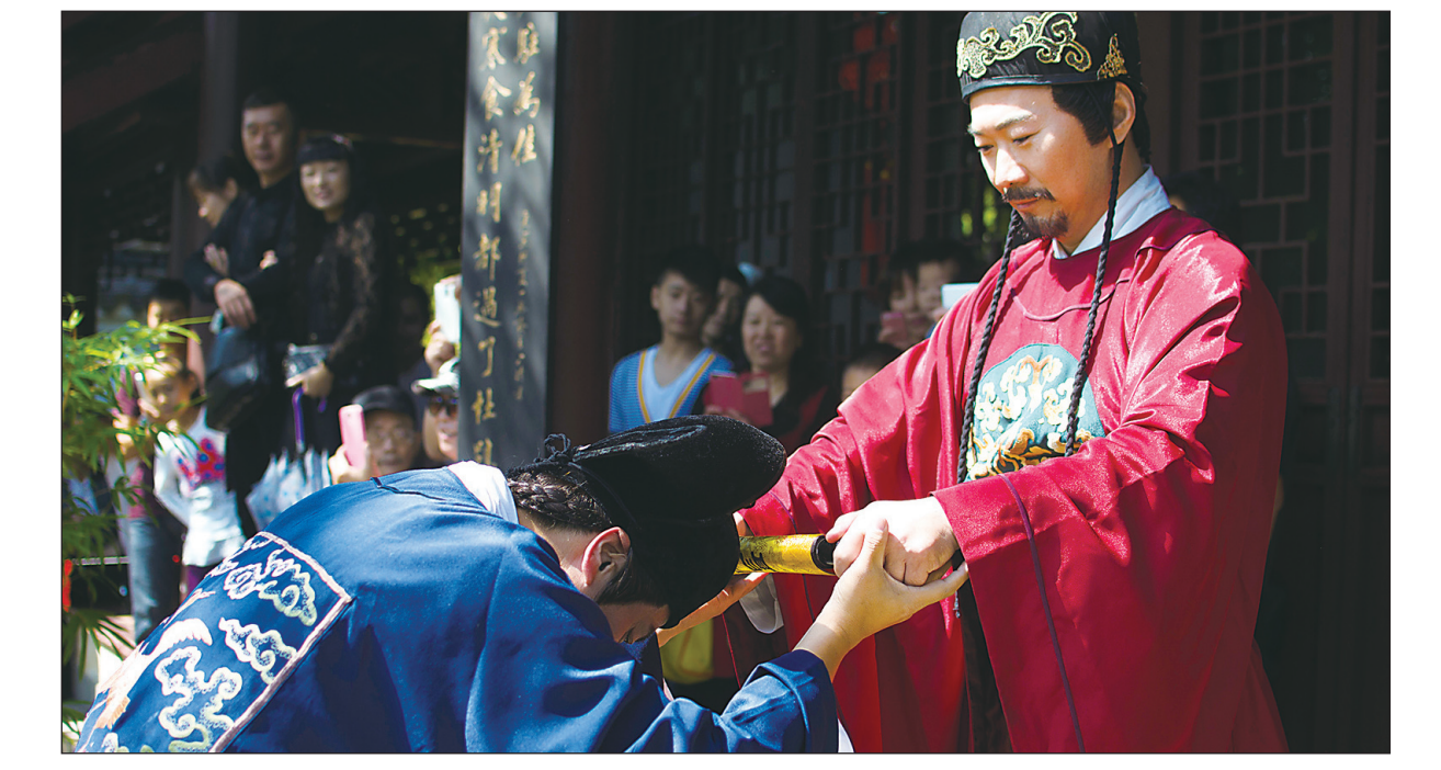
Two actors take part in the reenactment of an ancient Chinese story at Guyi Garden in Nanxiang Town.