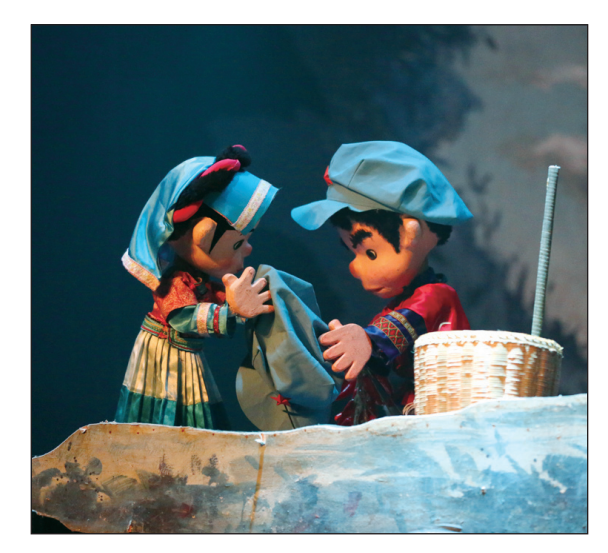
Classic puppet show "Little Red Army Soldier"