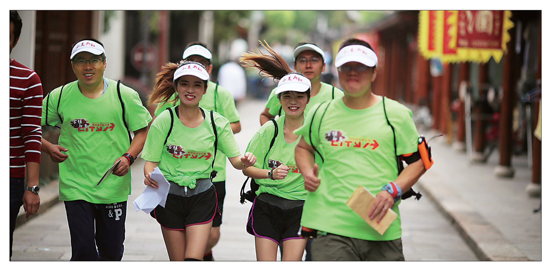
Young people participate in the orienteering contest held during the National Day holiday.