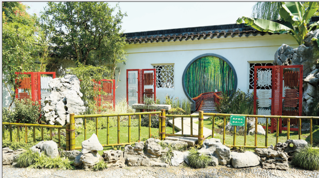
A garden featuring bamboo at Guyi Garden where a bamboo culture festival is underway