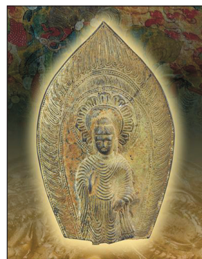
A bronze sculpture of Buddha from the Northern Wei Dynasty (386-534 AD)