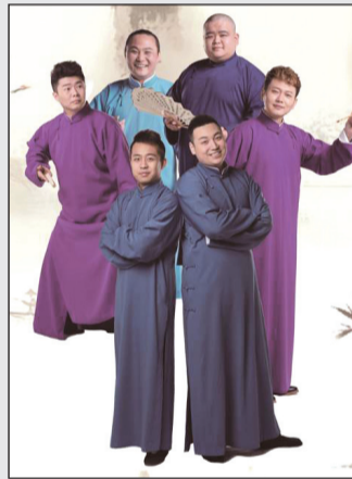
Deyun Crosstalk Association

Shanghai farce "Seventy-two Tenants," which is performed in Shanghai dialect, and xiangsheng crosstalk shows performed in putonghua , brought by Deyun Crosstalk Associate, will amuse the audience with hilarious shows.