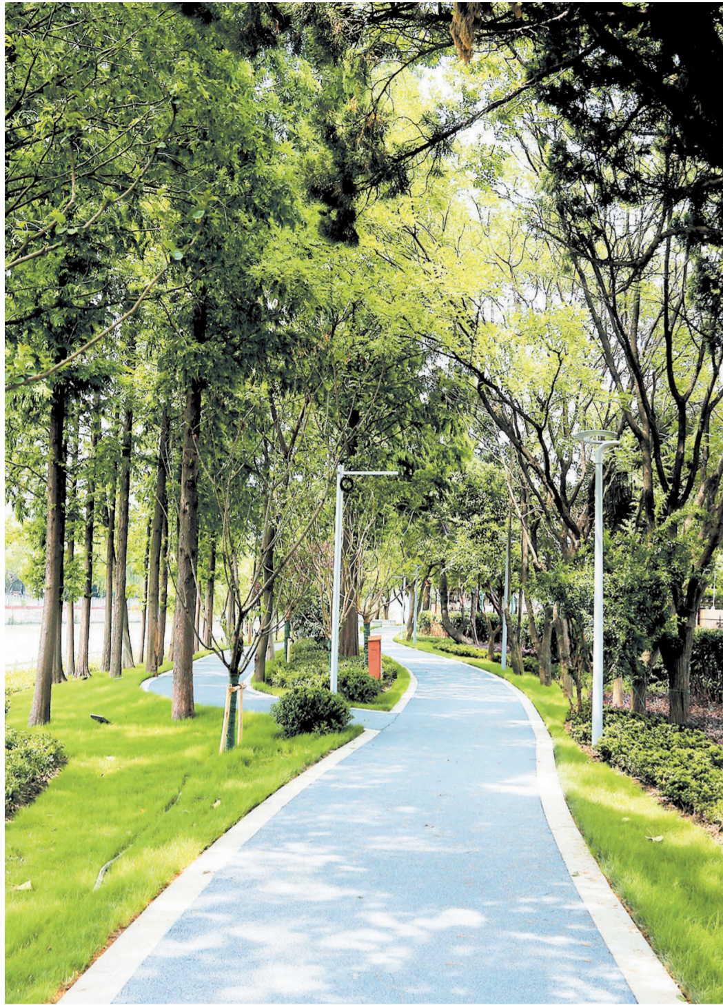
The environment along the footpath becomes greener.