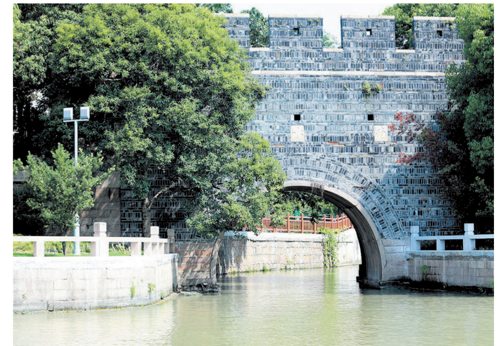
The South Water Pass