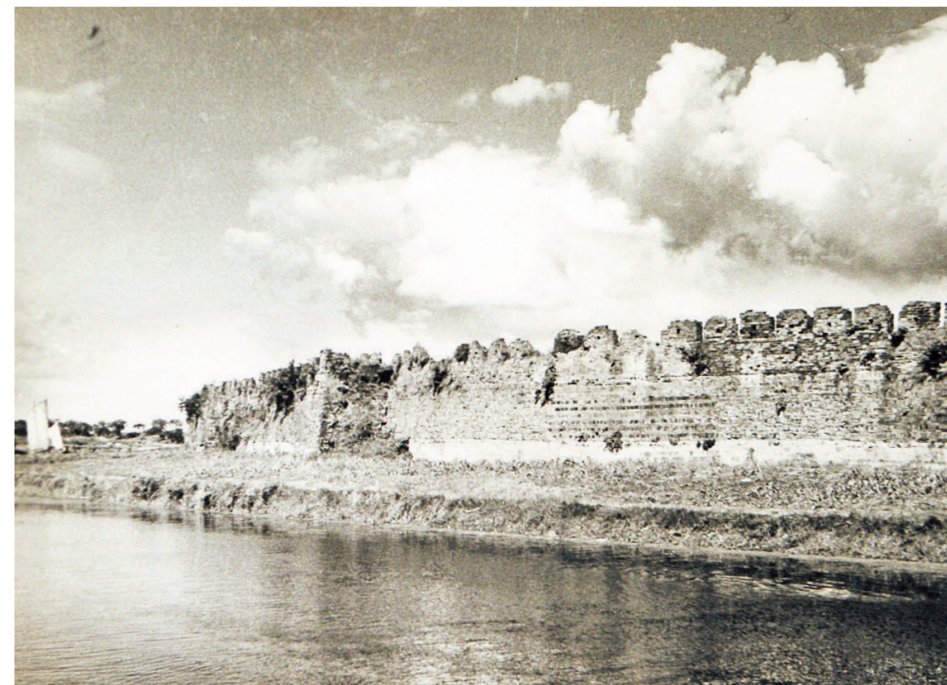
The wall north to the West Gate in 1951 — Wang Yongtang