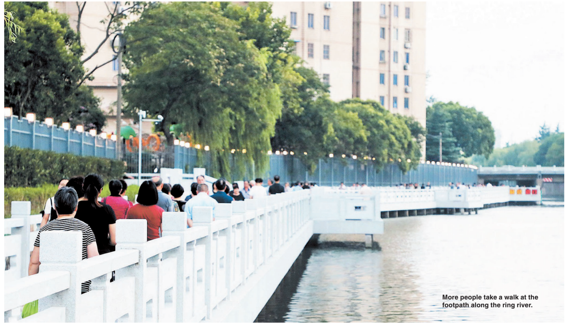
More people take a walk at the footpath along the ring river.