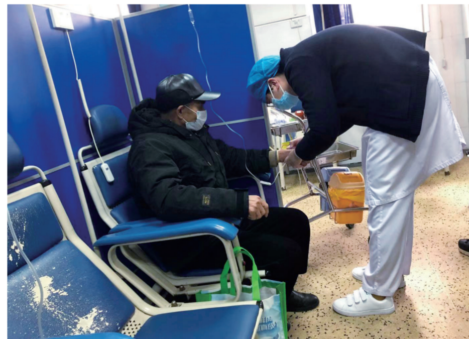
A nurse helps a patient put on a drip in hospital. — Ti Gong