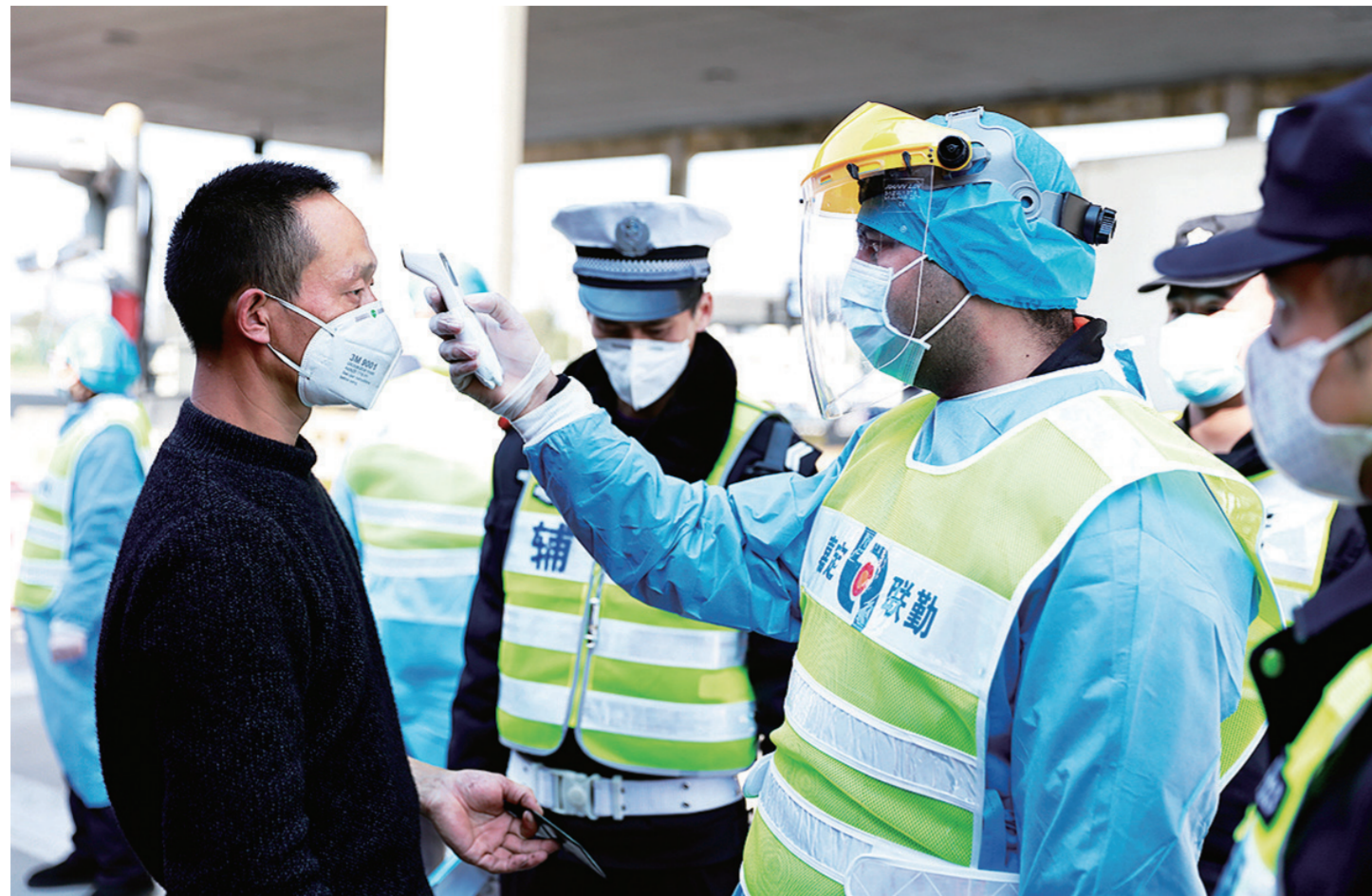
Above: The police take a resident's temperature to make sure he is in good health. Right: A community volunteer takes a resident's temperature before he drives back into the neighbourhood. Below: A worker takes garbage to a garbage sorting truck.