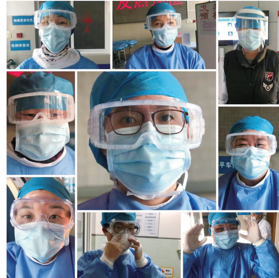
Doctors wear surgical hats, masks, goggles and protective suits to fight against the novel coronavirus.

High-rise buildings have placed packets of tissue in elevators that people are encouraged to use when pressing buttons. Used masks are safely recycled or disposed of. Special trash cans have been set up in