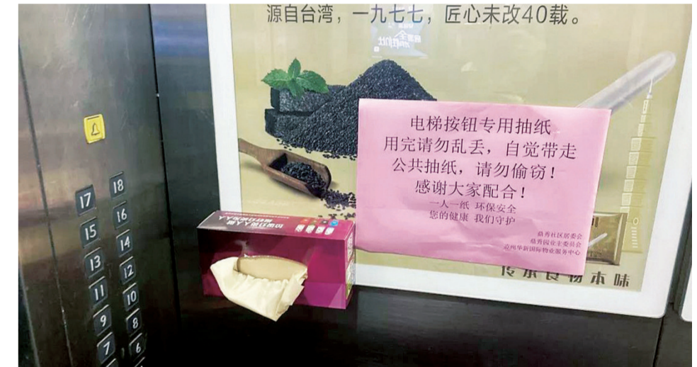
High-rise buildings in Jiading have placed packets of tissue in elevators that people are encouraged to use when pressing buttons.