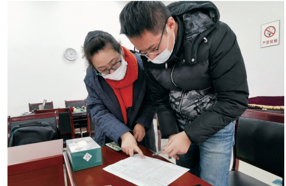
Community's staff members check the household information.