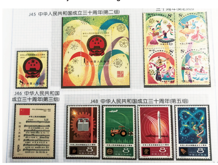
The stamps are issued in 1979, marking the 30th anniversary of the founding of New China.