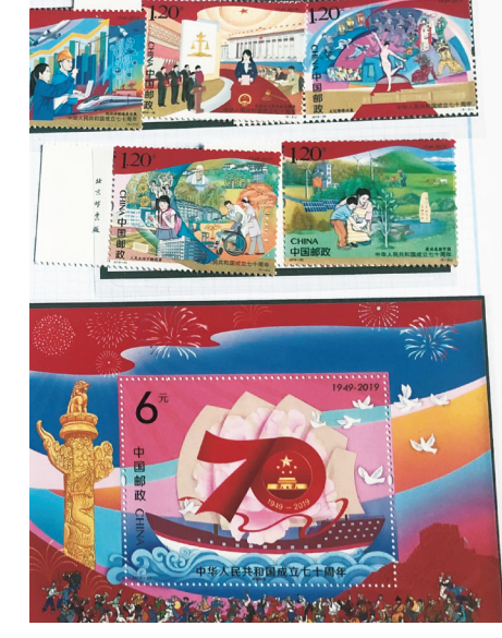
The stamps Xu collected last year to celebrate the 70th anniversary of New China's founding.