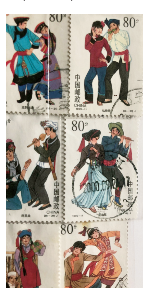
A series of stamps featuring 56 nationalities in China

Xu, a retired teacher, set up the first township folk collection organization in Jiading in 2016. The collection association has about 40 members, holding a number of exhibitions including badges, stamps and envelopes.