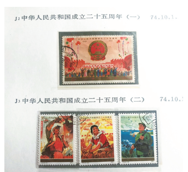
The stamps are issued in 1974, marking the 25th anniversary of the founding of New China.